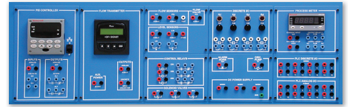
T5552A Control Panel

The T5552A features three types of controllers on its control panel: relay control for automatic on/off liquid level control, the PID controller for variable electronic control of either liquid level or flow, and PLC control for both on/off and PID control of the system. These controllers allow learners to practice process control procedures using both automatic and manual controls.