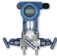
T5552-F1 Smart Flow Transmitter

Learners can also easily interchange optional transducers and valves with the standard ones by using hand-tightened pipe unions and plug-in electrical connections. The T5552A includes two standard transducers, level and flow, and allows for additions from the T5552-F1, such as Smart Flow Transmitter, Pitot Tube Flow Transducer, Venturi Flow Transducer, and Orifice Plate Flow Transducer. The T5552A can also expand to include the Ultrasonic Liquid Level Learning System (T5552-L1).