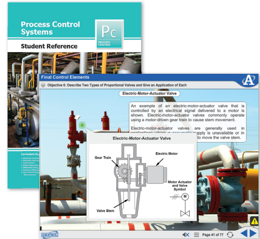
Interactive Multimedia Curriculum and Student Reference Guide