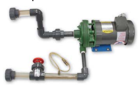
95-PM1-A Learning System

The 95-PM1-A will teach learners invaluable skills related to application, installation and operation of pumps while creating practical understanding of efficiency and flow/pressure issues. Learners will become skilled in centrifugal pump installation, operation of a series centrifugal pump system and a parallel pump system, measurement and graphing of flow/pressure characteristics of a parallel centrifugal pump system. As well as performance curve usage in determining the head and capacity of a series centrifugal pump system and a parallel pump system, and more.