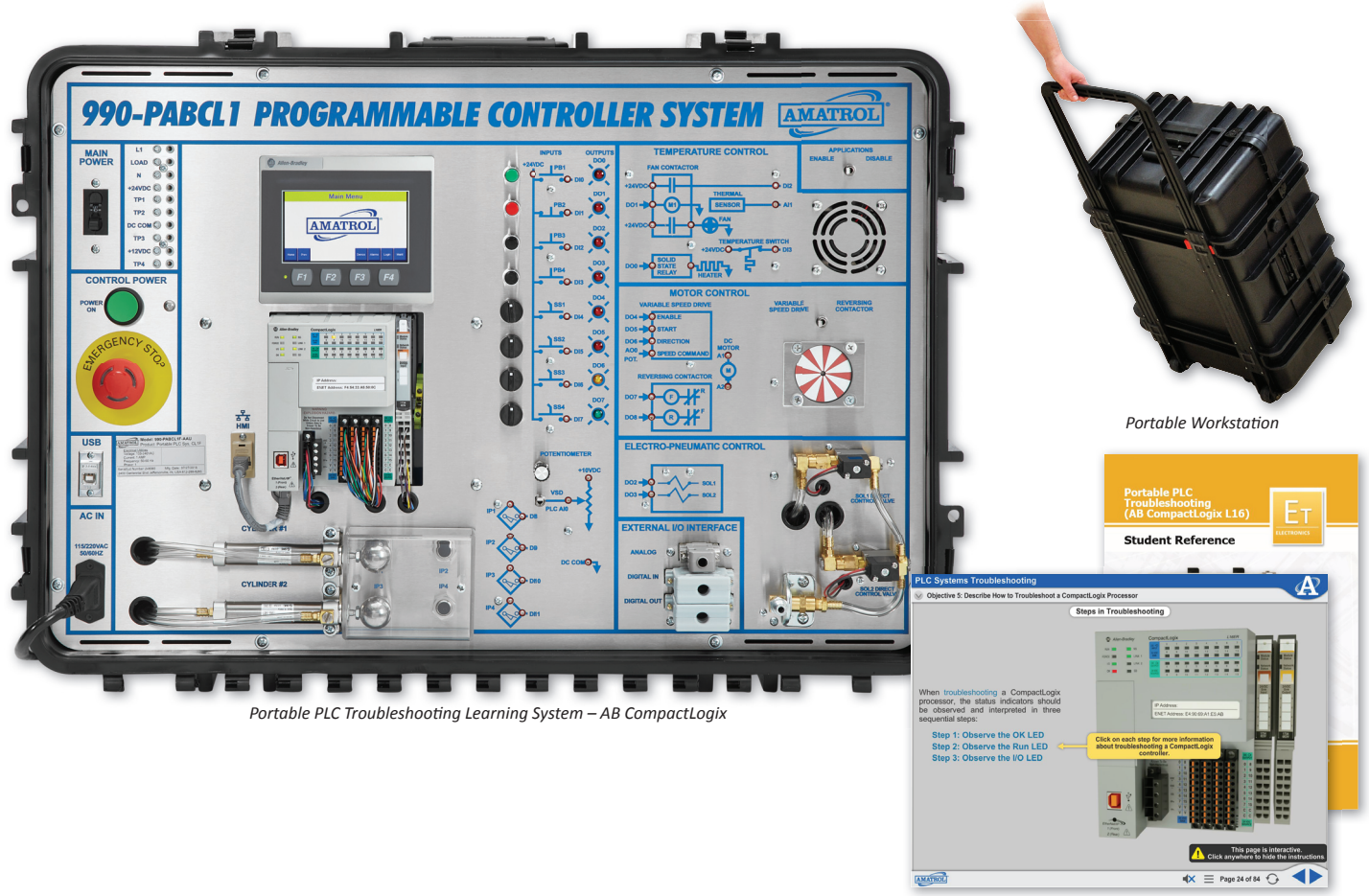
Interactive Multimedia Curriculum and Student Reference Guide