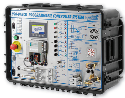
Portable PLC Troubleshooting

Portable PLC Troubleshooting includes an Allen-Bradley L16ER 5370 Processor & HMI Screen, two double-acting pneumatic cylinders, two control valves, a potentiometer, variable speed drive, external I/O interface, temperature control and an emergency stop button all within a portable learning system. Learners will use these components to perform troubleshooting skills on a variety of topics, such as thermostatic temperature control, variable speed motor control with feedback and electro-pneumatic controls. Learners will also practice the programming and operation of industrial PLCs.